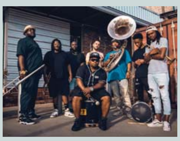
TBC Brass Band

When the Krewe of Black & Gold took roots in 2019, the goal was to celebrate New Orleans' favorite football team while also celebrating the city's culture, traditions and culture bearers. Those plans were quickly derailed when COVID-19 led to shutdowns and event cancellations, and tragic losses of so many lives.